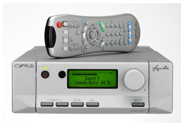
Cyrus DAC XP Signature

Build quality is up to the Cyrus norm. The DAC XP Signature looks neat and well made, although it's no better constructed than the company's entry-level products (which retail for way less than a grand).