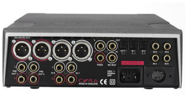
Cyrus DAC XP Signature

Take a look around the back and you'll find a packed rear panel.