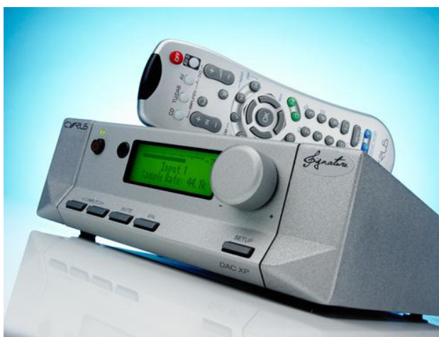
Cyrus DAC XP Signature

We're pretty happy with the soundstaging. It's impressively focused and nicely layered. Tonally, things err towards the traditional Cyrus leanness – there's little warmth or richness here, so the treble can turn a little brittle if the rest of your kit has similar tendencies.