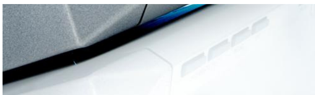
Cyrus DAC XP Signature

Cyrus products have always prioritised agility, precision and detail resolution above all else, and this revised DAC XP excels in all these areas.